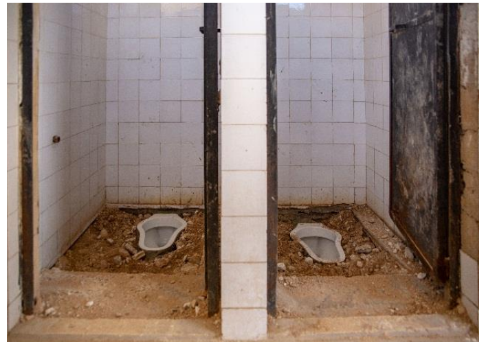
Rehabilitation of 4 public schools in Aleppo and Damascus Rural, March 2020.