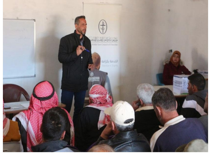
Technical training related to livestock farming, March 2020, photo credit: MECC website.