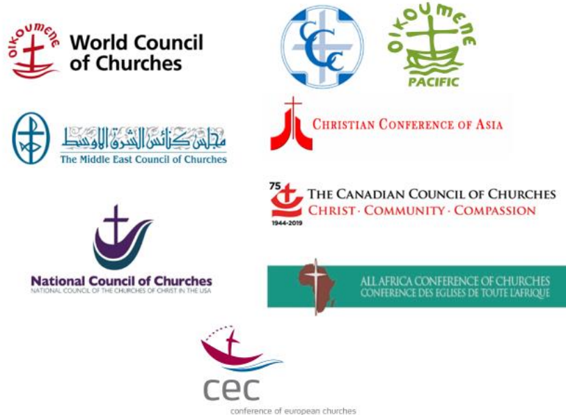
Logos: World Council of Churches, Middle East Council of Churches and the Regional Ecumenical Organizations.

Blessed be the God and Father of our Lord Jesus Christ...who consoles us in all our affliction, so that we may be able to console those who are in any affliction with the consolation with which we ourselves are consoled by God.