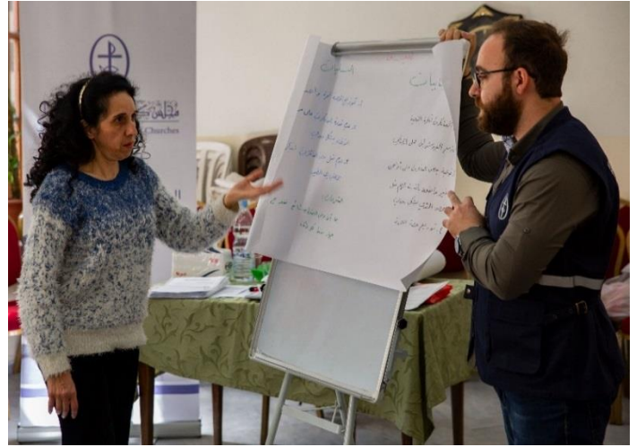
Refresher health awareness sessions for 60 women, March 2020, photo credit: Diakonia.