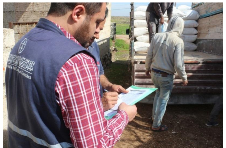
Distribution of cattle fodder for 400 beneficiaries in Daraa, March 2020, photo credit: MECC website.