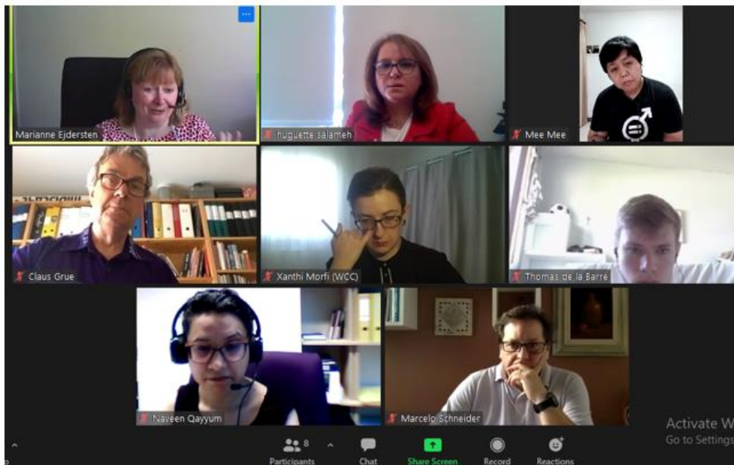
Online Meetings Gathering the Communication Directors of REOs Continue, June 24, 2020, photo credit: MECC website.