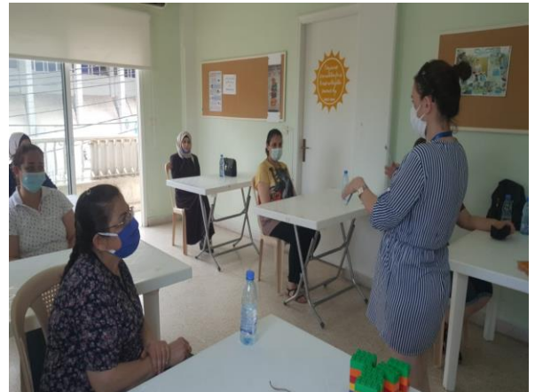
Soft skills session (L) and health awareness session (R), June 2020, Photo Credit: Diakonia.