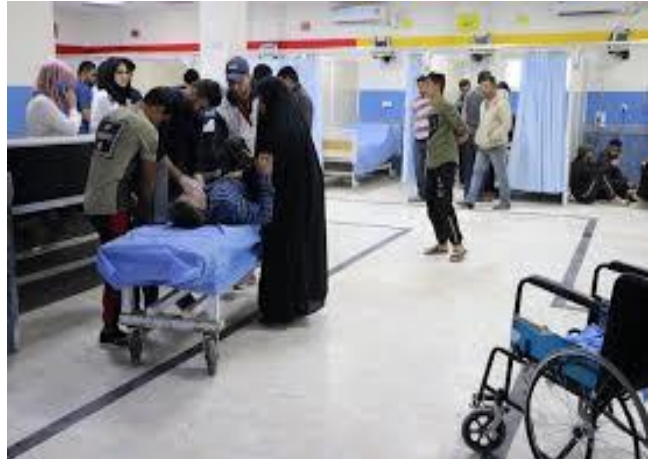
Picture of overcrowded hospital in Iraq. April 2, 2020, Photo Credit: Medecins Sans Frontieres.