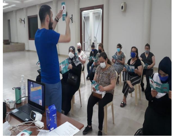
PSS for kids (L) and GBV session for women (R), June 2020, photo credit: Diakonia.