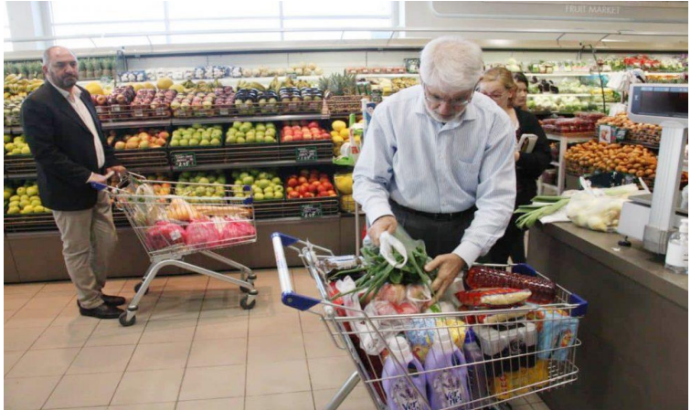
Cyprus resuming normal economic activity. June 2, 2020, Photo Credit: Cyprus Mail.