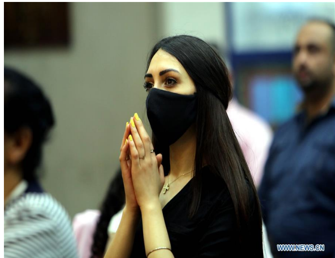
A Jordanian Catholic wearing a face mask attends a Mass at a Catholic church in Amman, Jordan, June 6, 2020