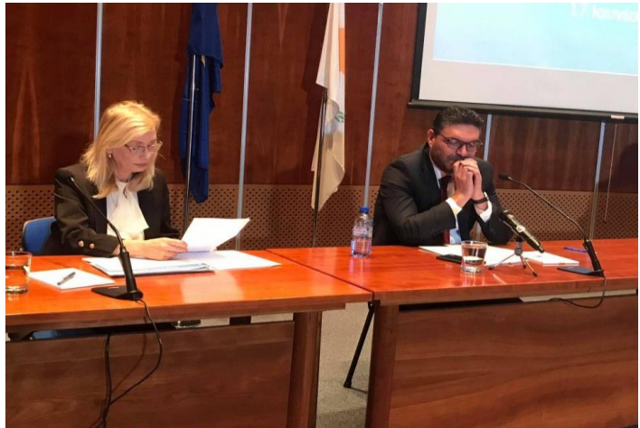
The cabinet's meeting to approve the new set of measures, June 17, 2020, Photo Credit: Cyprus Mail.