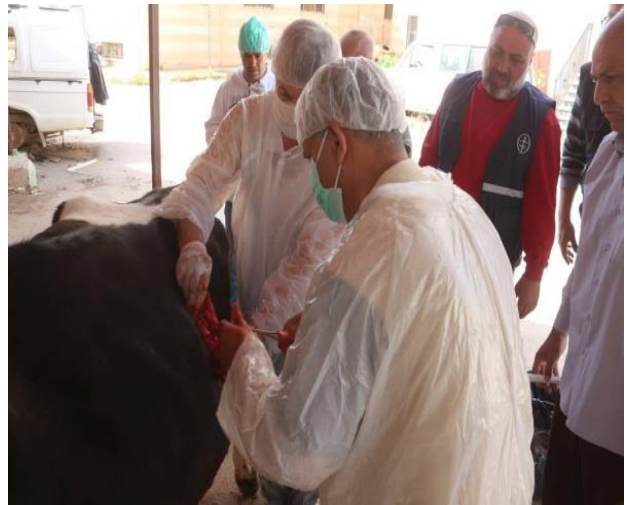
Veterinary services to hundreds of cattle owner in Daraa, June 2020, Photo Credit: Diakonia Syria