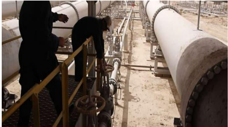
Oil refinery plant in Iraq, June 15, 2020, photo credit: Reuters.