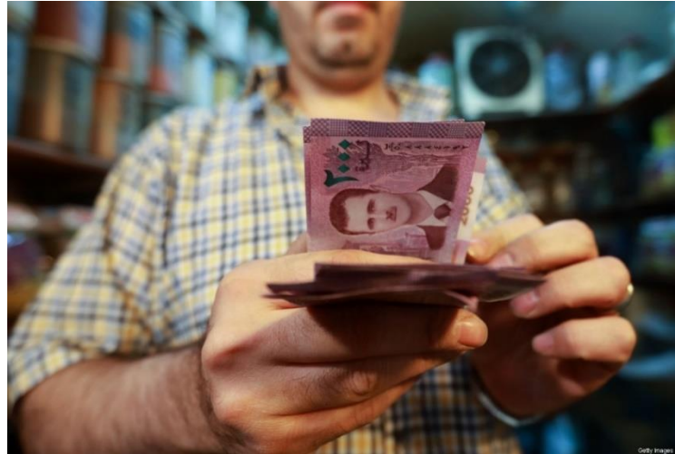
A merchant counts Syrian pound notes, bearing a portrait of the Syrian President Bashar al-Assad, at the Bzourieh market in the centre of the Syrian capital Damascus on 11 September 2019