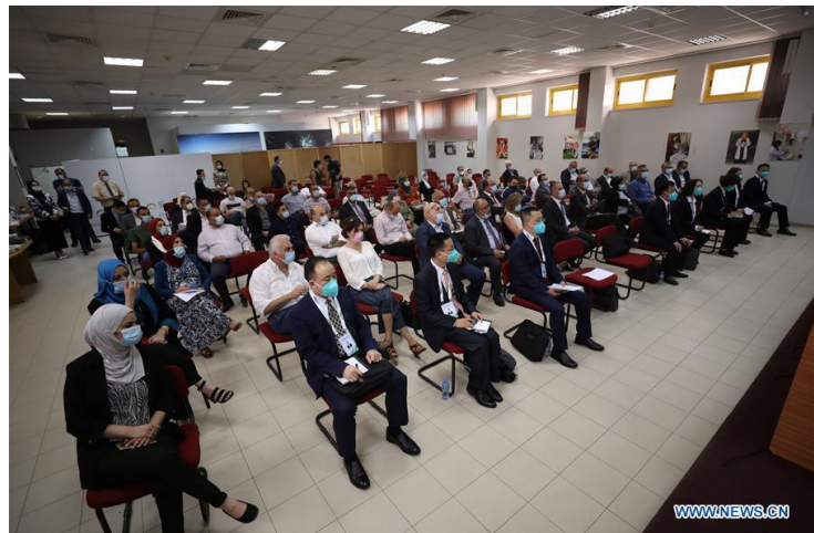
Chinese medical team members attend a meeting with Palestinian health officials in the West Bank city of Ramallah, June 11, 2020, Photo credit: Nobani/Xinhua