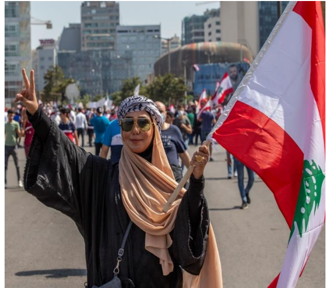
Image of a peaceful protest in Lebanon, hours before turning into a violent one, June 7, 2020, photo credit: Aljazeera.