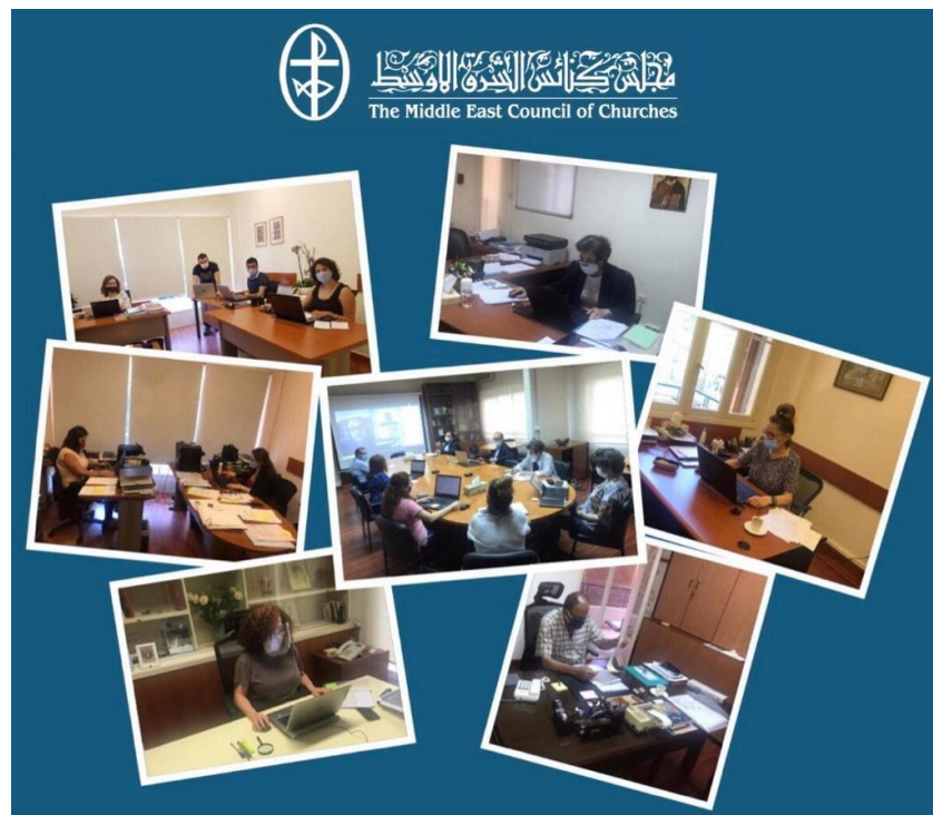
MECC team back to their offices. June 2020, Photo Credit: MECC Website.

Now that quarantine is over, life is back to normal at the MECC HO in Beirut (June 23, 2020)