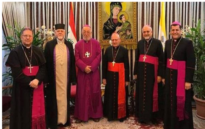
His Beatitude Cardinal Louis Raphael Sako and members of the Chaldean Patriarchate in Iraq, June 17, 2020