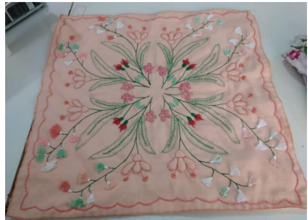
Distribution of vouchers for NFI items (L) and the product of an embroidery class (R), June 2020, Photo Credit: Diakonia.