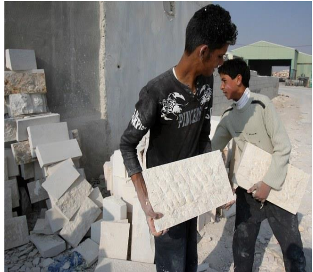
Jordanian teenagers work at a stone cutting workshop in the industrial area of Sahab, 40 kms south of Amman, December 22, 2008.