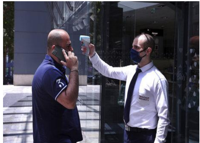
Lebanon is currently witnessing a decreasing number of new corona cases, June 14, 2020, photo credit: Naharnet.