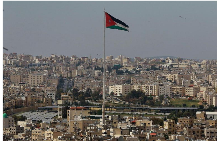
New moves against corruption and tax evasion, were announced by Jordan's Government on June 14, 2020.