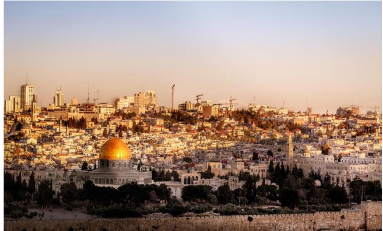
Jerusalem, Palestine, Photo Credit: albwaba.com