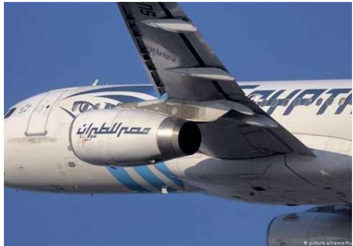
Stricter measures will be applied on inbound flights, June 16, 2020