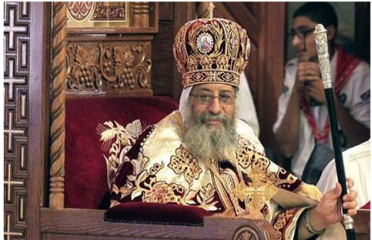
His Holiness Pope Tawadros II head of the Egyptian Coptic Orthodox Church, June 1, 2020, Photo Credit: Reuters.