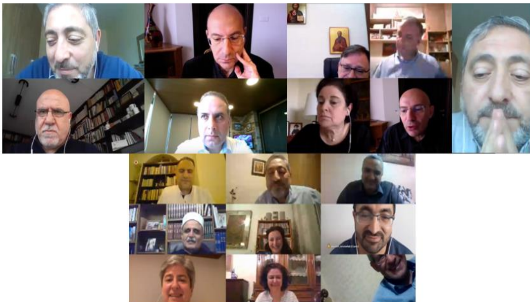
KAIROS meeting held online. June 5, 2020

Following the strategic orientation aiming at keeping an ongoing interreligious dialogue about Christian-Muslim relations and relations with other religions such as with Jews, the Theological & Ecumenical Department held the 5th consultation seminar of the process on Tuesday June 2, 2020 in order to continue the preparation of the “Kairos Middle East: Towards Churches Global Compact” white paper. The seminar, which focused on Christian-Muslim relations in particular, was held via an online platform. Before the meeting, experts in the field from the Middle East as well as experts from KAICIID were contacted and more than 20 responses were collected and consolidated to determine the axes of the discussion