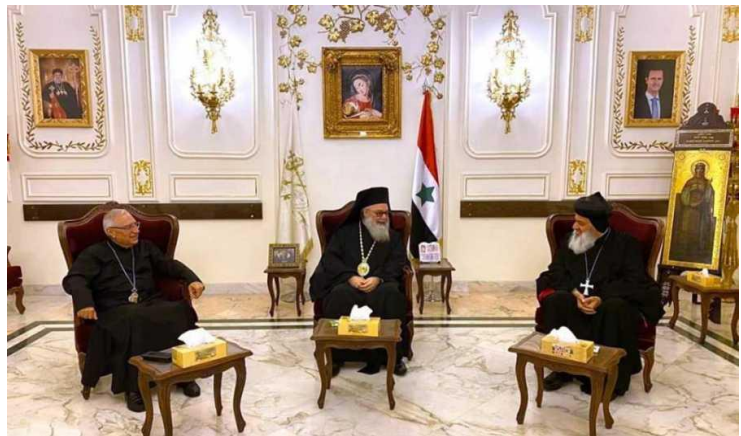
The three patriarchs convening at the Patriarchal Headquarters in Bab Tuma, Damascus, June 18, 2020 Photo Credit: Al Markazia.