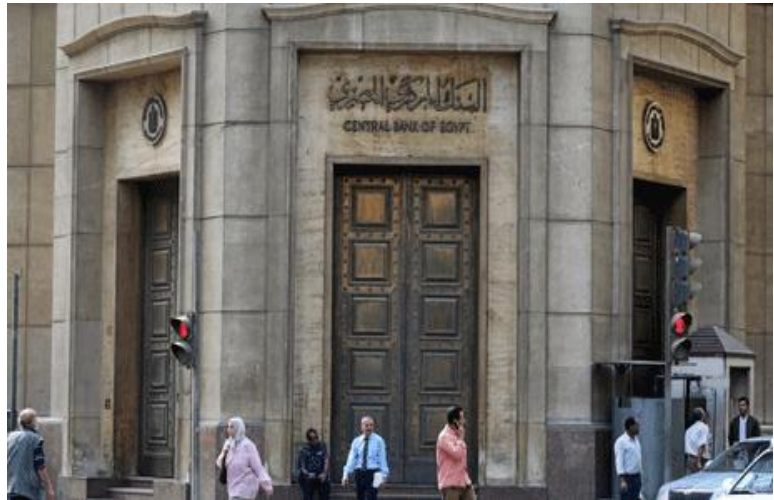
The Egyptian Central Bank offices in Cairo, Egypt, June 2020, Photo credit: Reuters.