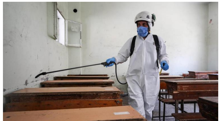
Decontamination under way in Syria's North, July 12, 2020