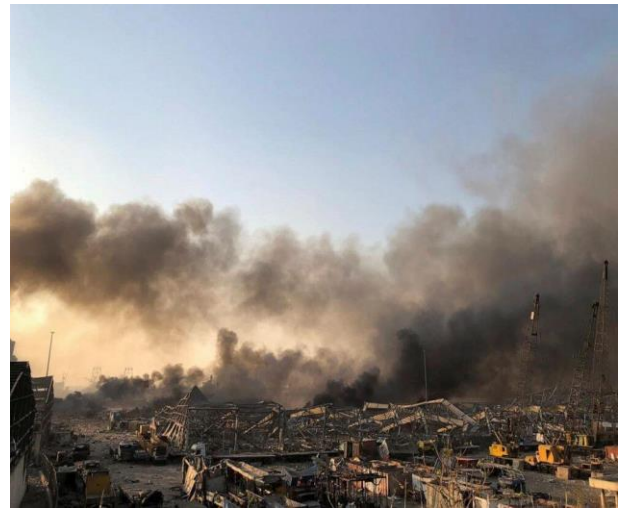
A picture of the aftermath of the explosion, August 4, photo credit: Reuters