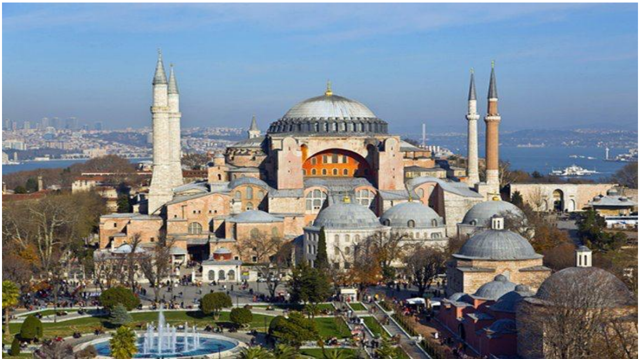
Hagia Sophia has fallen to Recep Tayeb Erdogan's political ambitions, July 11, 2020, photo credit: MECC website.

The Middle East Council of Churches: The Turkish Government's decision to convert the "Hagia Sophia" church into a mosque is Violation of religious freedom and coexistence