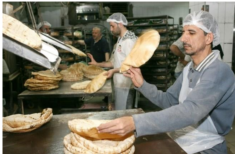
A worker arranges Lebanese bread at a bakery in Beirut, Lebanon, April 17, 2012.