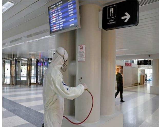
Passengers will conduct a PCR upon their arrival at the Rafik Hariri International Airport “at the airline’s expense.” June 24, 2020