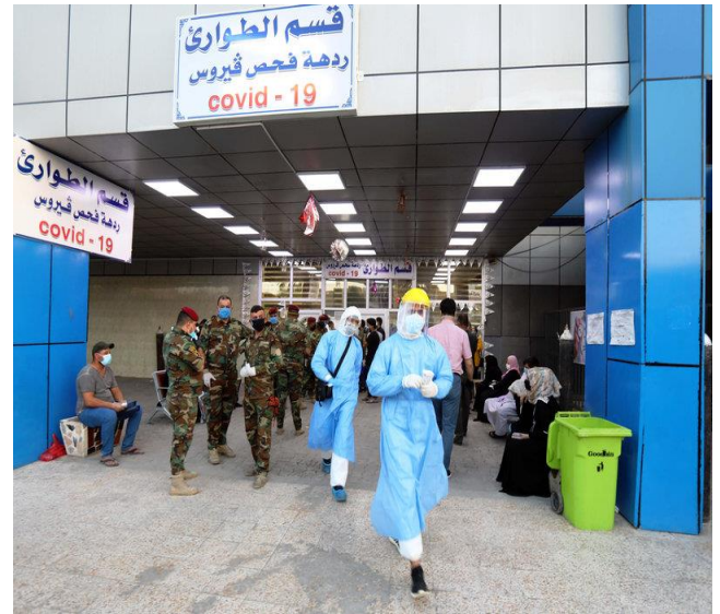
People wait for COVID-19 tests at a hospital in Baghdad on June 4