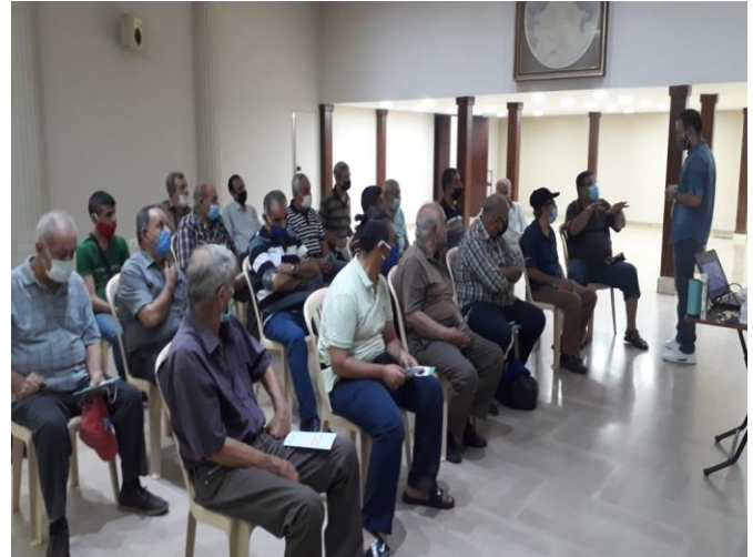
Health Awareness Session (L) and GBV Session for men (R), July 2020, photo credit: Diakonia.