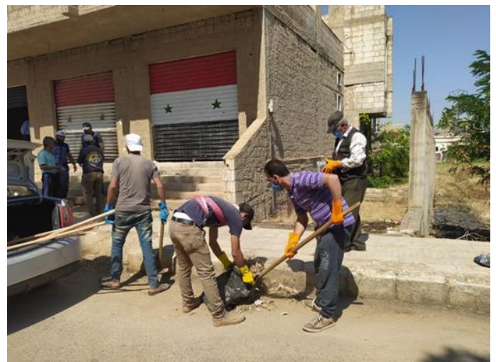
Waste management activities in Izraa and Sheikh Maskin, July 2020, photo credit: Diakonia.