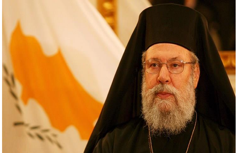
Archbishop Chrysostomos, Primate of the Church of Cyprus, November 13, 2019, Photo Credit: orthodoxtimes.com