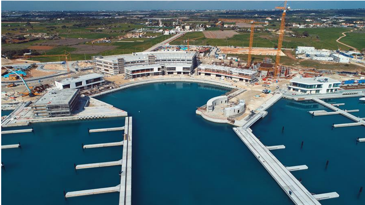
A Picture of a shipping dock in Cyprus, June 16, 2020, photo credit: Financial Mirror.