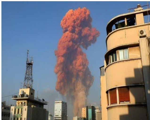
A cloud of deadly orange smoke which emanated from the reaction of chemical agents, August 4, 2020

It occurred during a time, in which the country is struggling with the exponential increase in corona cases and a ransacked economy. In other words, the country, which has been saddled with corruption and governmental negligence, is finally imploding. The following pictures sum up the devastation that followed the country: