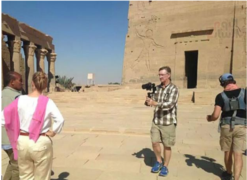
Australian delegation filming film to attract tourism in Luxor, July 7, 2020, photo credit: Egypt Today.