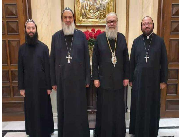
HB Patriarch John X and HH Mor Ignatius Aphrem II posing after discussions, July 10, 2020