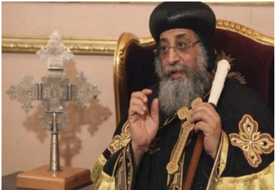
His Holiness Pope Tawadros II, June 28, 2020, photo credit: Egypt Today.