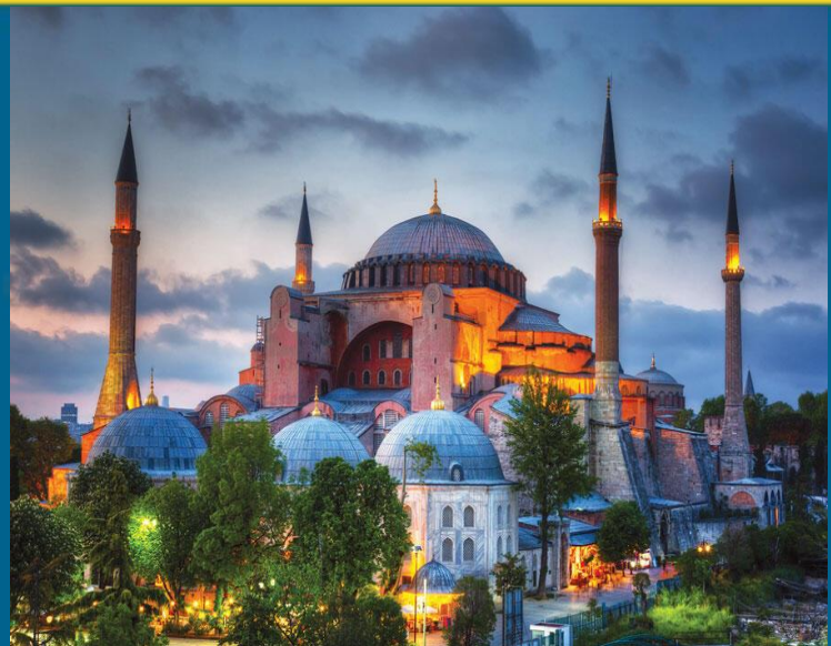
The Symbolic Hagia Sophia has been converted back into a mosque among International outrage, July 2020, photo credit: Hagia Sophia hurriyetdailynews.com