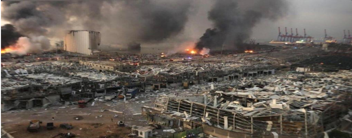
A picture of the aftermath of the explosion, August 4

Another event also devastated the Middle East and the world: The Hagia Sophia, was reconverted into a mosque, while ignoring the massive criticism from the International community and organizations such as the UNESCO. The Middle East is already in tatters and suffering from sectarianism. Therefore, such a move seemed only to cause discord and hinder peace building in the region.