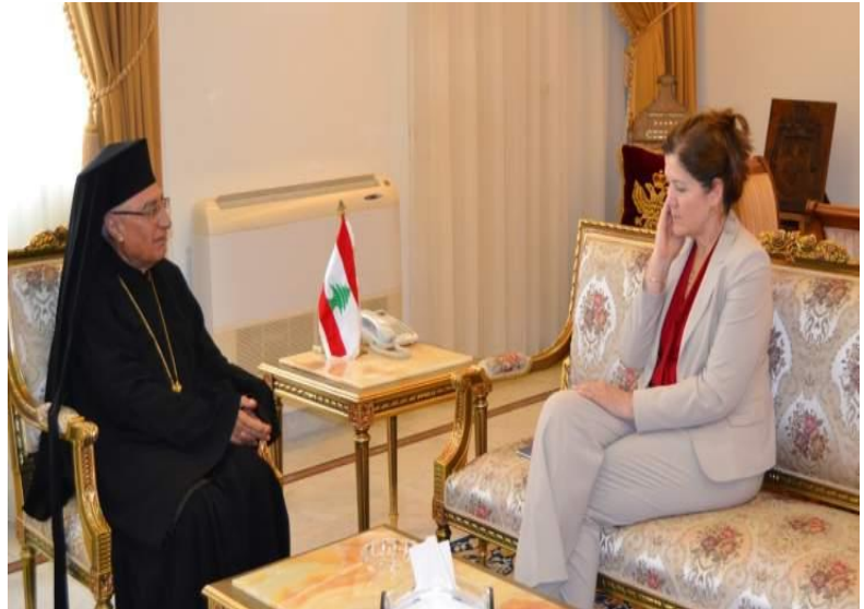
HB Patriarch Youssef el Absi in a meeting with the US ambassador, June 29, photo credit: El Nashra.