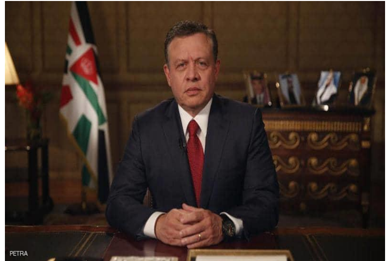
The Jordanian King His Majesty Abdullah II, July 12, 2020