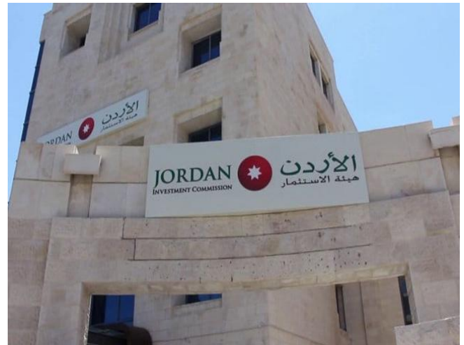
Fifty new investment ventures have been licensed and registered during the COVID-19 pandemic in various investment sectors, according to the Jordan Investment Commission, July 1, 2020, photo credit: Jordan Times.