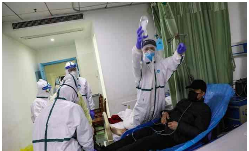
A COVID response team treating a patient in one of the hospitals in Egypt, July 13 2020, photo credit: Youm 7