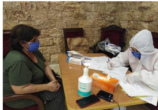
Women empowerment session (L) and the distribution of food vouchers (R), July 2020, photo credit: Diakonia.