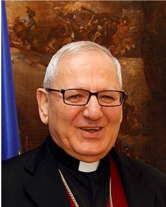
His Beatitude Cardinal Louis Raphael Sako, June 29, 2020