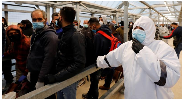
The occupied West Bank has reported more than 3,700 cases since the outbreak began, July 5, 2020, Reuters.