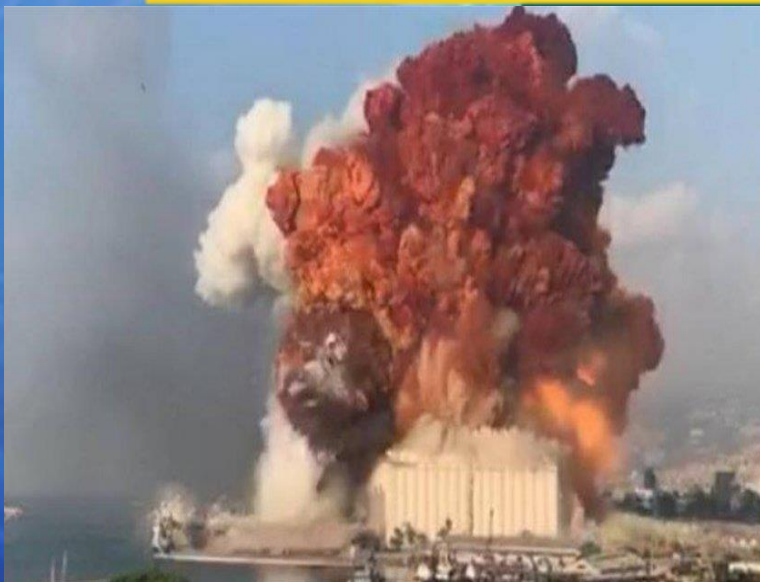
The moment the massive explosion took place at the seaport of Beirut, August 4, 2020, Photo Credit: LBCI