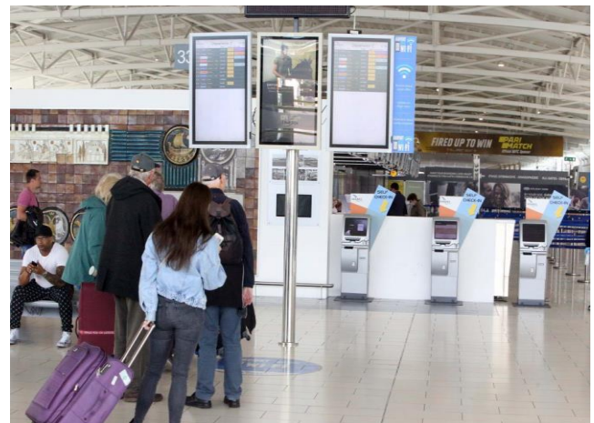
Citizens for 36 countries can now visit Cyprus, June 29, 2020, photo credit: Cyprus Mail.