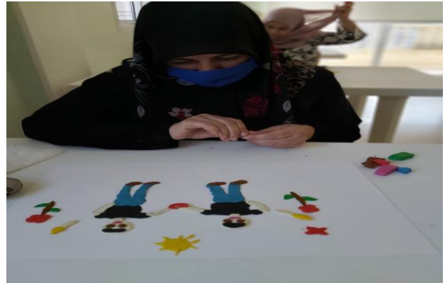
PSS and soft skill sessions for women and children, July 2020, photo credit: Diakonia.