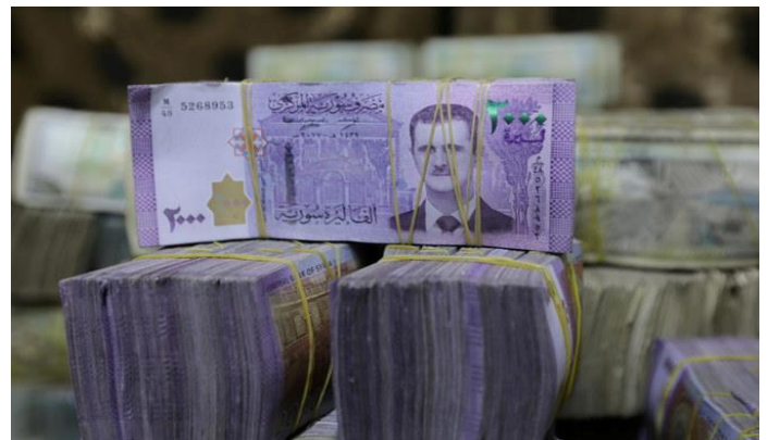
Syrian pounds are pictured inside an exchange currency shop in Azaz, Syria.