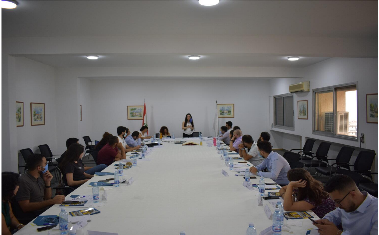
Youths from various denominations and backgrounds engaging in a discussion, July 11, 2020, photo credit: MECC website.

As part of the “Kairos Middle East Towards Churches Global Compact” process, the Theological and Ecumenical Department (TED) of the Middle East Council of Churches (MECC) organized the first youth consultation seminar on the 11th of July 2020, at the St Augustine center in Kafra – Ain Saade, Lebanon.