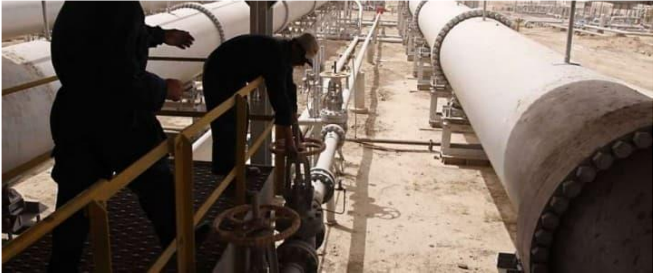
Oil refinery plant in Iraq, June 15, 2020, photo credit: Reuters.