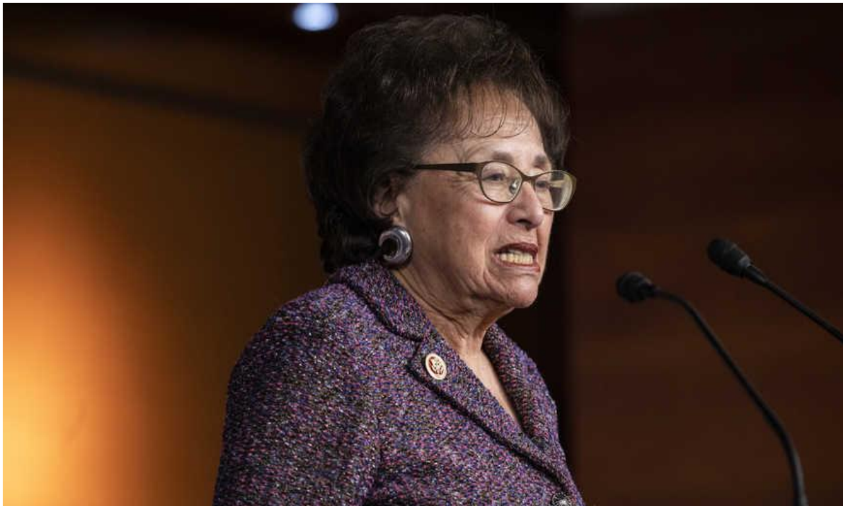
US Rep. Nita Lowey, D-N.Y., speaks in Washington, Jan 28, 2020