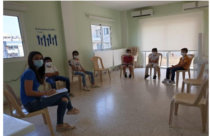
GBV sessions for youths and adolescents, July 2020, photo credit: Diakonia.