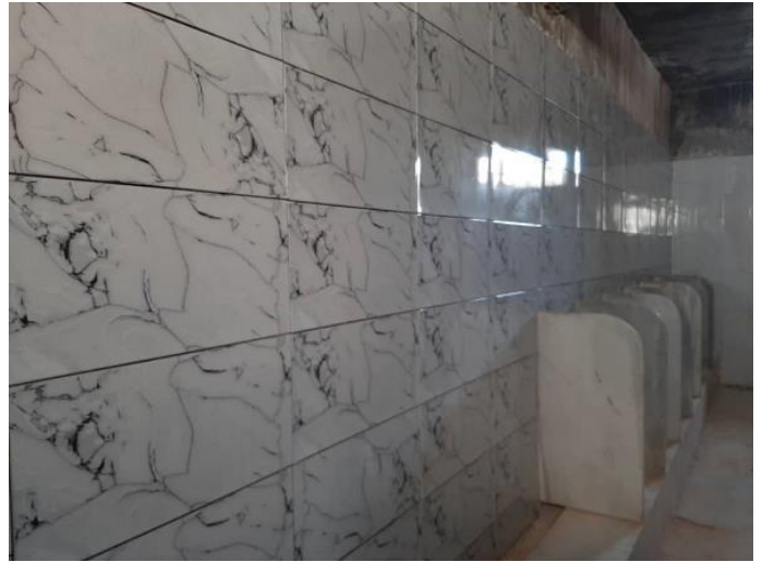
Rehabilitation 4 public schools in Aleppo and Damascus Rural, April 2020, Photo credit: Diakonia