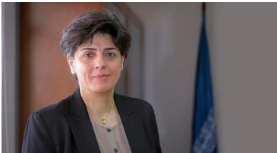
Dr. Souraya Bechealany, MECC Secretary General, April 8, 2020

Middle East Council of Churches: “Live this time in strong spiritual solidarity” (April 8, 2020)