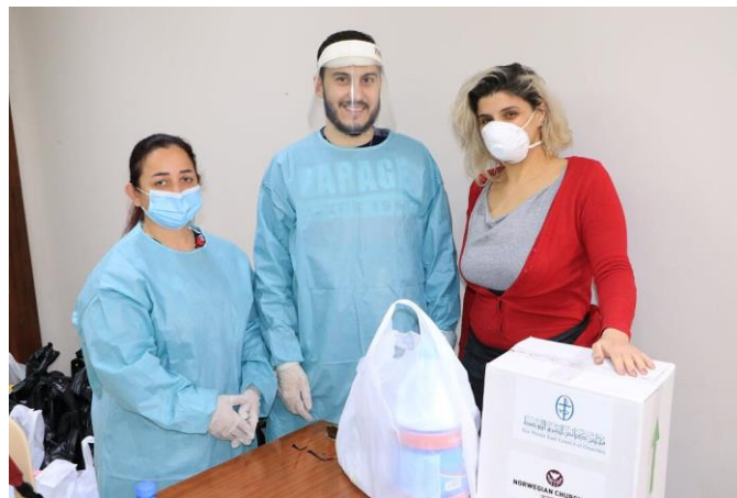
Distribution of hygiene kits and leaflets, April 2020, Photo credit: Diakonia