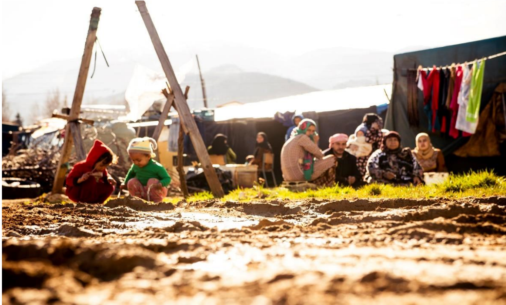
Syrian Refugees in Lebanon, April 27, 2020