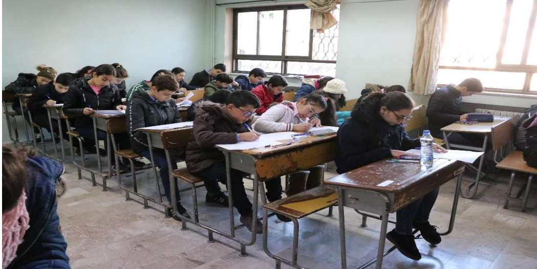
Tuition fees support for 100 students, April 2020, Photo Credit: Diakonia.