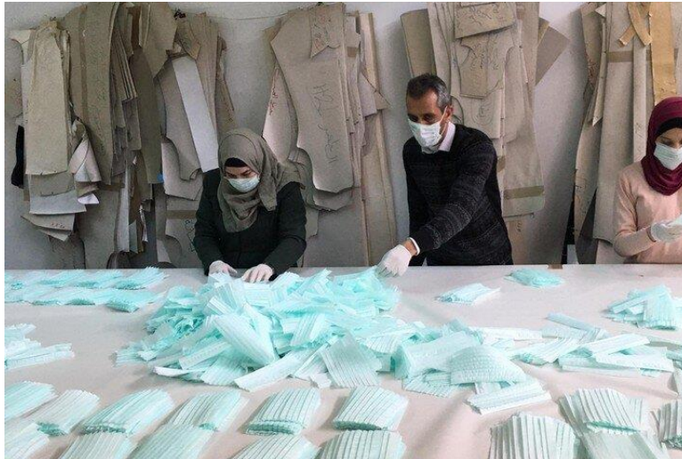
Manufacturing face masks, April 2020

DSPR updated report on COVID-19 in the Middle East (April 6, 2020)