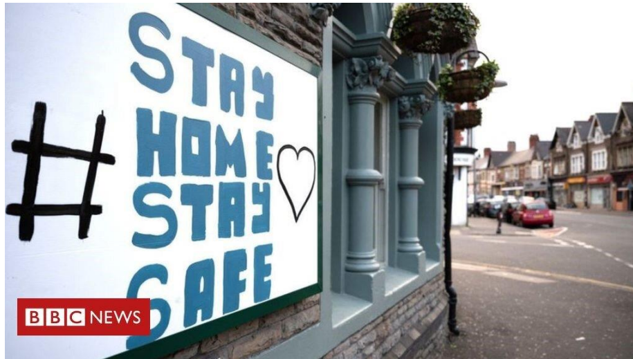
April 29, 2020, Photo credit: BBC News