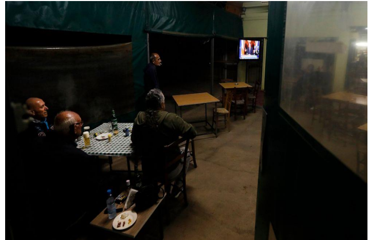
Cypriot men sit at a social club and watch the televised address of Cypriot President Nicos Anastasiades explaining the need for additional restrictions to beat back a surge in COVID-19 cases in Nicosia suburb of Lakatamia, Cyprus, on Tuesday, Nov. 11, 2020.