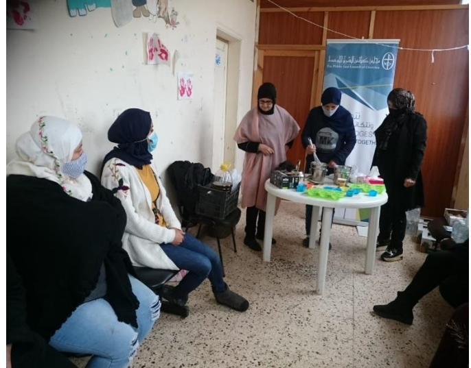
Home care and soap making session, Nov, 2020