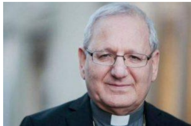
His Beatitude Cardinal Louis Raphael Sako