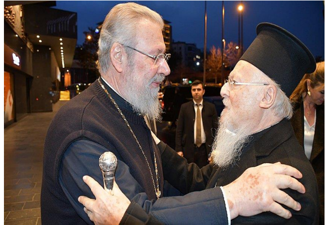
His All Holiness Ecumenical Patriarch Bartholomew welcomed personally Archbishop Chrysostomos of Cyprus at his Hotel in Constantinople last year.