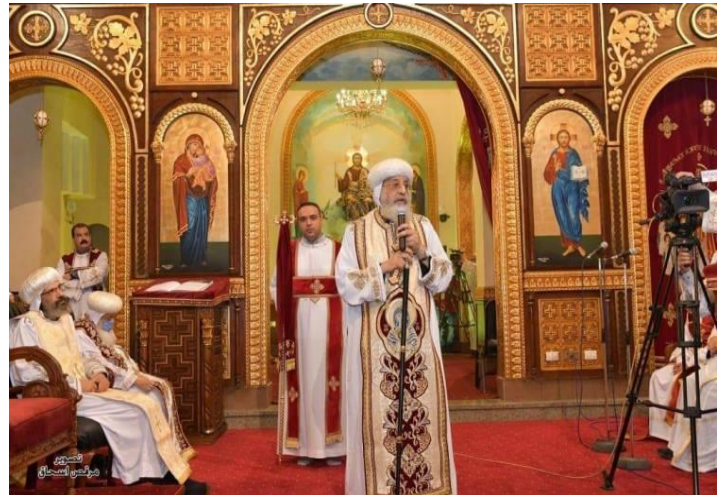
HH Pope Tawadros II during the event, Nov. 17, 2020, photo credit: Mobtada