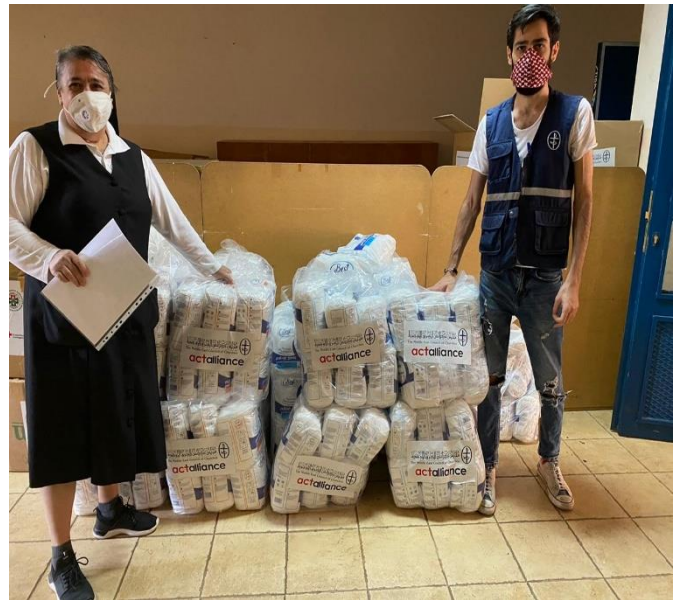
Distribution of vouchers and NFI's, Nov, 2020