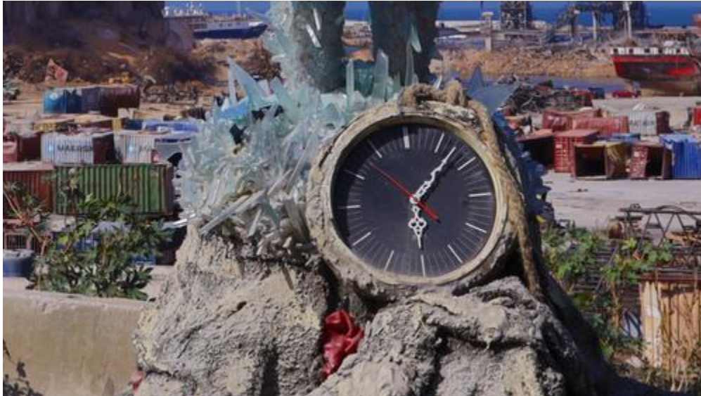
The statue that was built following the Beirut Port Blast, November 2020, photo credit: MECC website

On the National Day of Deacons a salutation from the Protestant Dutch Church, entitled: Beirut a story of hope! (November 2020)