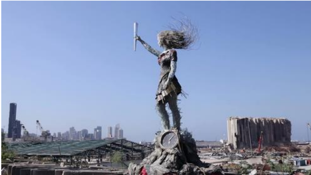
The statue that was built following the Beirut Port Blast, November 2020

The MECC Communication and Public Relations Department produced a shorted documentary entitled “Beirut, a story of hope”, in cooperation with the international organization "Kerk In Actie"; as a salutation of peace and love to every Lebanese who was injured in the capital, and as a message of hope to the whole world. This documentary was screened in the Netherlands during the celebration of the National Day of Deacons in the Dutch Protestant Church, in order to show solidarity with the Lebanese and to motivate the believers of this church to support their brothers and sisters in the wounded Beirut.