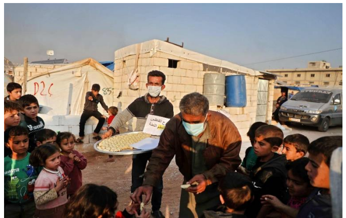
Men distribute traditional desserts to children at a camp for displaced Syrians in Kafr Dariyan, in the north of Syria's northwestern Idlib province, during the Corona Pandemic.