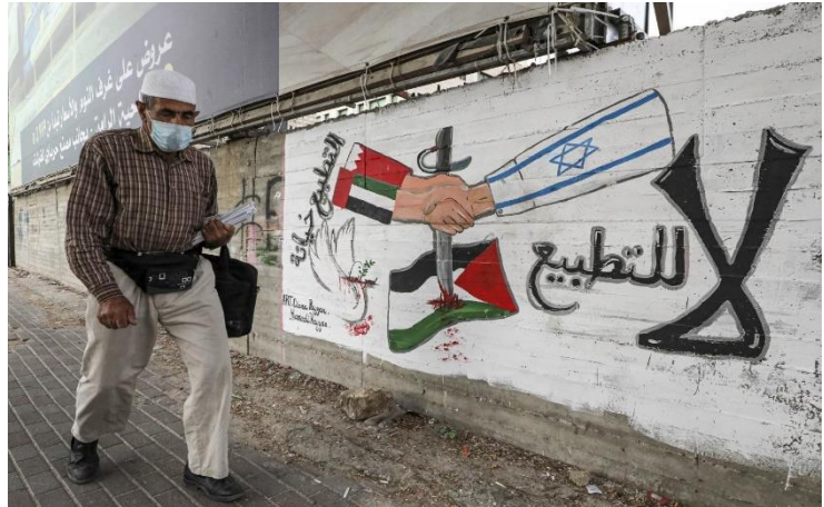
'Normalisation is betrayal,' reads mural in Palestinian West Bank city of Hebron