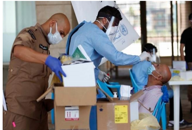
Lebanon to receive COVID-19 vaccine by mid-February: Hasan, Nov. 23, 2020, photo credit: Daily Star.