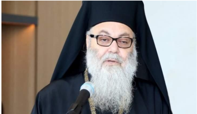
Primate of the Orthodox Church of Antioch, HB Patriarch John X of Antioch and All the East, photo credit: El Nashra.