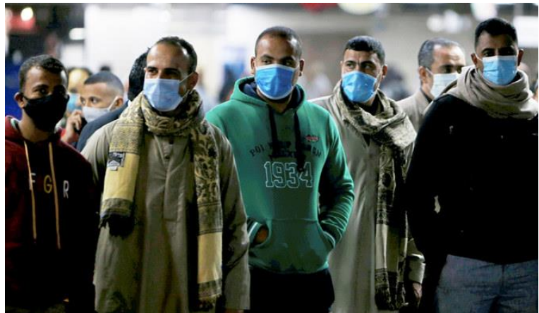
Men in protective masks wait for the train at a metro station in Cairo.