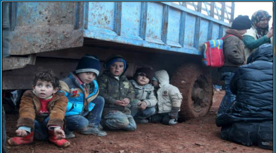
Helpless children in Iraq have nowhere and no one to go to, April 13, 2017, The Daily Beast