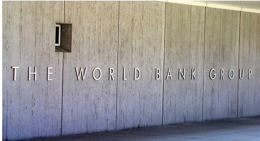
The World Bank issued a warning about Iraq's high poverty levels, Nov. 16, 2020, photo credit: Modern Policy.