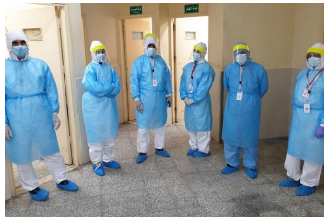
Medical workers in Gaza face a serious shortage of equipment to battle the quickly spreading COVID-19 outbreak