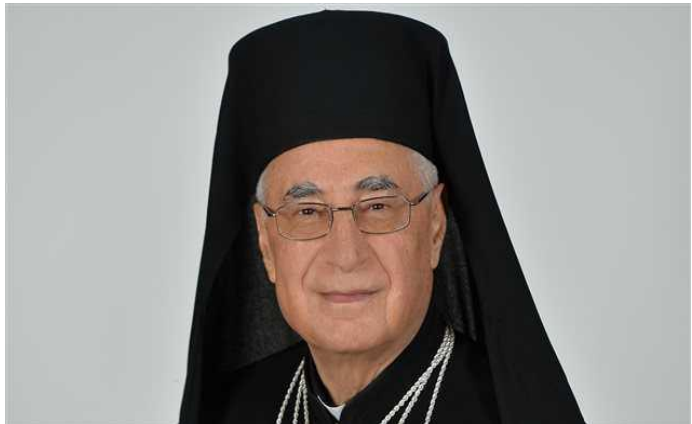
HB Patriarch Youssef el Absi, The Patriarch of the Melkite Greek Catholic Church.