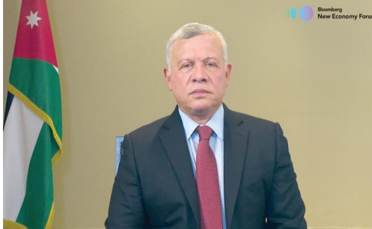
His Majesty King Abdullah during his participation in the Bloomberg New Economy Forum, Nov. 17, 2020