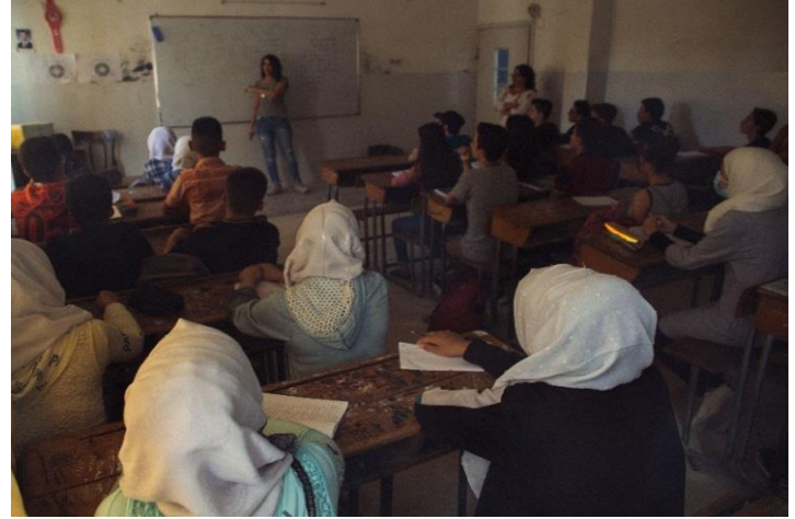
Remedial courses in Aleppo and Damascus rural, Nov. 2020