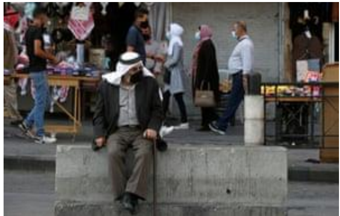
Mask wearers on the street in Amman.