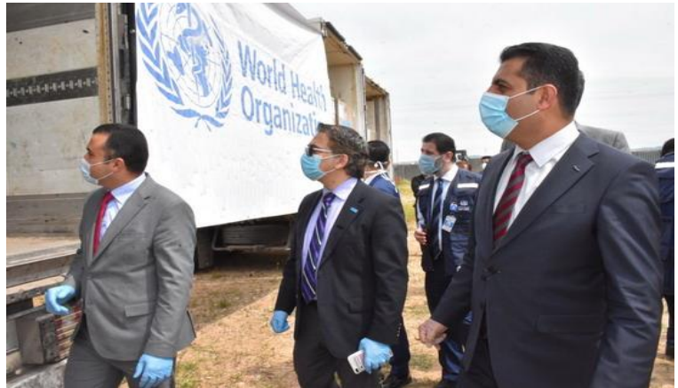
The World Health Organization (WHO) had provided medical supplies and equipment to the Ministry of Health of the Kurdistan region of Iraq to support response efforts in fighting COVID-19, April 19, 2020