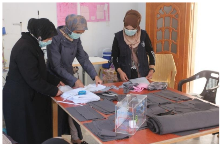
Vocational training for 120 youth in Dara, Nov. 2020, photo credit: Diakonia