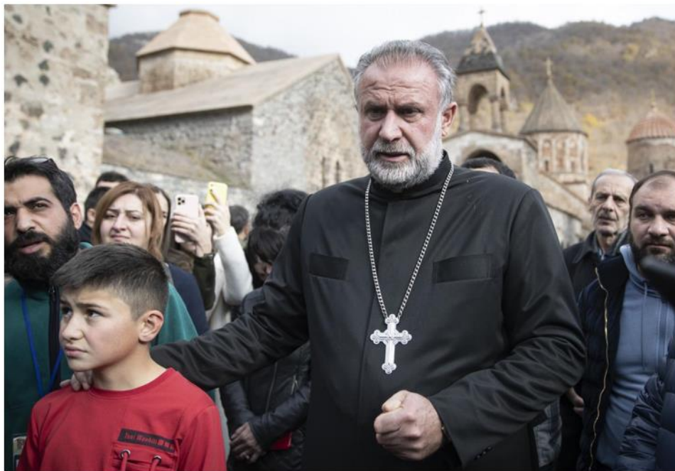
Father Hovhannes