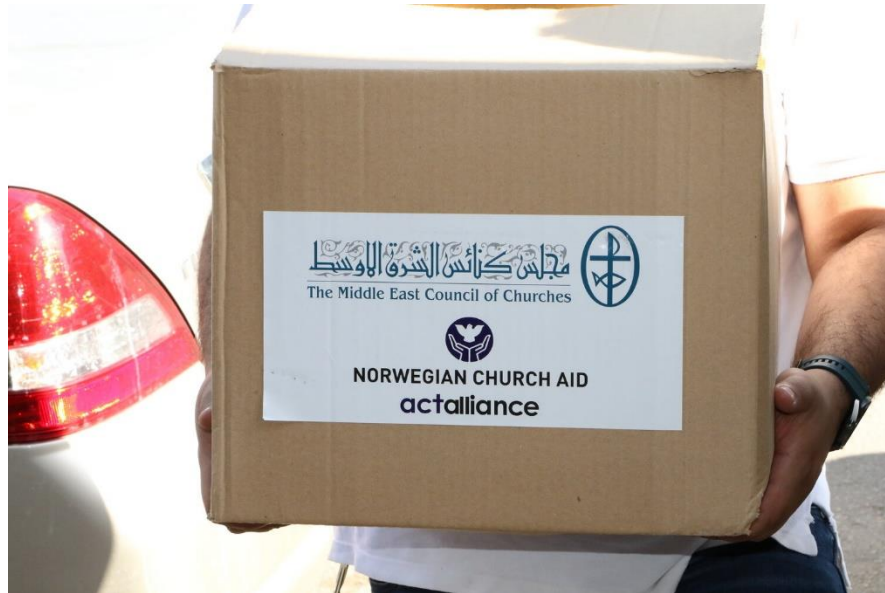
The MECC, with the support of its partners, is able to carry out its humanitarian mission in Beirut, November, 2020

Three months following the Beirut Blast, the Middle East Council of Churches (MECC) pursues its disaster relief work on the field. Therefore, the Department of Service and Relief - Diakonia provided a new batch of relief supplies to the member Churches, to be distributed accordingly to the poorest and most in need families.