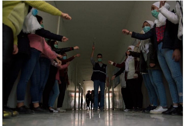
Recreational activities for students in Damascus rural and Aleppo, Nov. 2020