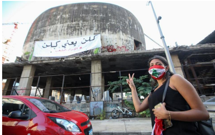
The IMF indicated that it did not provide any projections for Lebanon's economic indicators for the 2021-25 period due to an unusually high degree of uncertainty in the country. Oct 24, 2020, Photo credit Arabian Business,