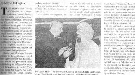
DELEGATES - The Secretary-General of the Middle East Council of Churches Riyad Jarjour consults with the Saudi envoy.